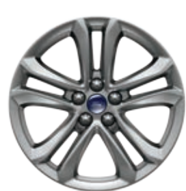
18" Split-Spoke Sparkle Silver-Painted Aluminum Standard on SEL Optional on SE