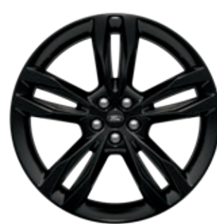
21" Premium Gloss Black-Painted Aluminum Optional; Included with ST Performance Brake Package