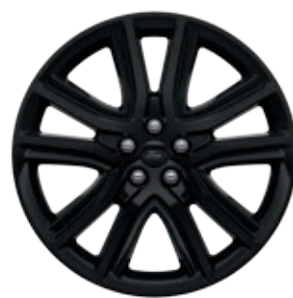
20" Premium Gloss Black-Painted Aluminum Standard on ST-Line