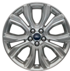
19" Luster Nickel-Painted Aluminum Standard on Titanium