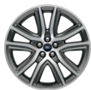
20" Bright-Machined Aluminum with Premium Dark Stainless-Painted Pockets Optional on Titanium