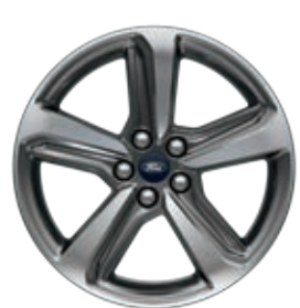
18" Bright-Machined Aluminum with Premium Dark Stainless-Painted Pockets Optional on SEL