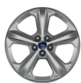
18" Sparkle Silver-Painted Aluminum Standard on SE