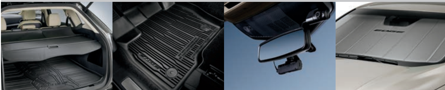
Cargo area protector and cargo cover