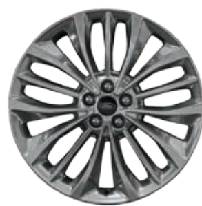
20" Polished Aluminum Included with Titanium Elite Package