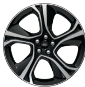
20" Bright-Machined Aluminum with High-Gloss Black-Painted Pockets Standard on ST