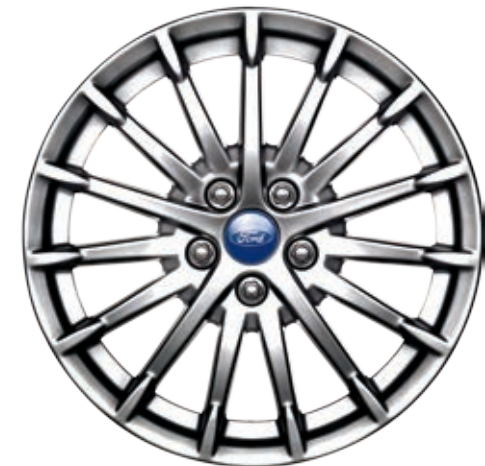
17" 15-Spoke Sparkle Silver-Painted Aluminum