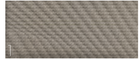
1 Medium Light Stone Cloth – Standard