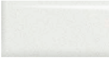
White Platinum Metallic Tri-coat