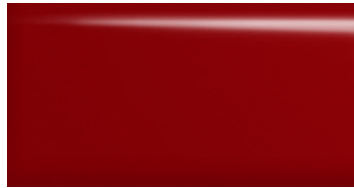
Hot Pepper Red Metallic Tinted Clearcoat